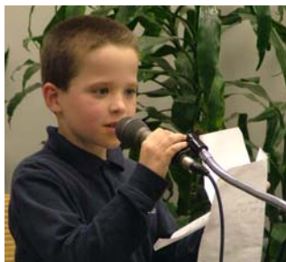
Comedy by Burke

REMEMBER TO USE GOODSEARCH AS YOUR SEARCH ENGINE ON THE INTERNET.