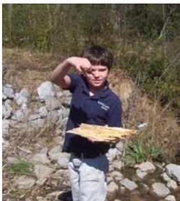
Photos from the No Student Left Indoors Course